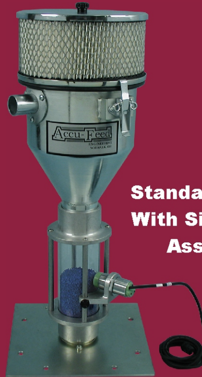
Standard Loader With Sight Glass Assembly