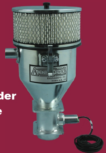
Standard Loader With Flange